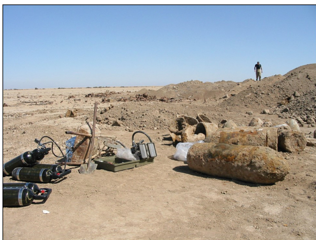
FIG 4 Excavated R400 bombs from Al Azizia site. On the left of the photo is the drilling prototype device called MONICA.

Other experiences from the field. In addition to the treaty verification example, which applied qPCR in the field and confirmatory sequencing at a reference laboratory, our expert panelists described their experiences as fast followers in the field. Examples