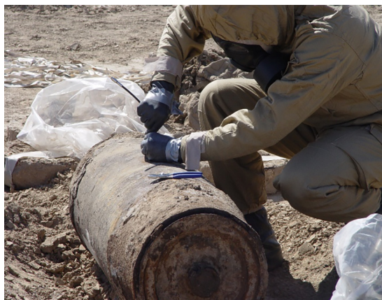
FIG 3 Sampling from R400 bomb body that was filled with liquid agent.

tested the samples for chemical warfare and biological warfare agents, and the results confirmed the presence of potassium permanganate and Bacillus anthracis DNA. The results of the reference laboratory analysis were reported to the Security Council. The genome of Bacillus anthracis was identified using a multilocus variable number of tandem repeat analysis (ML-VNTR), published in 2000 (36).